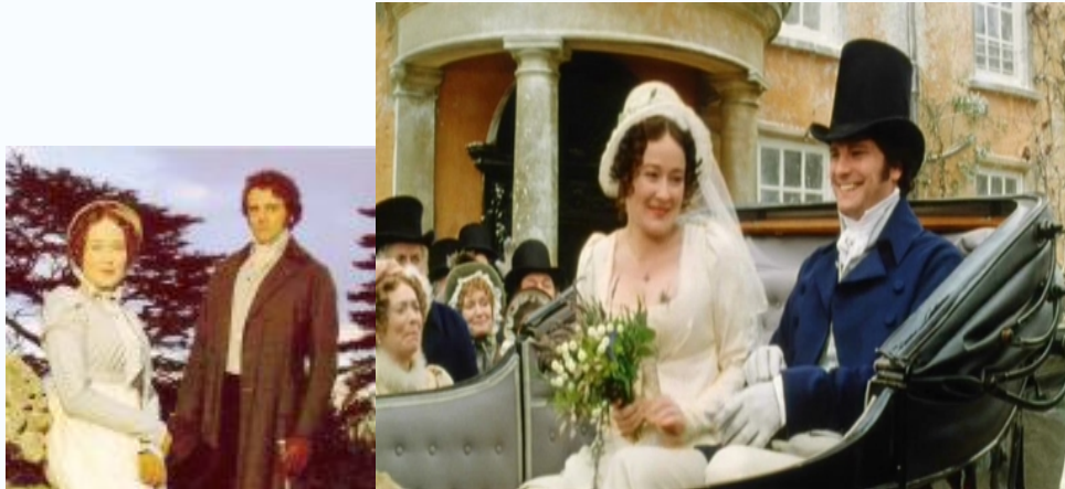
"Pride and Prejudice"

Differences are also about dresses and habits.