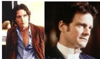
Mark Darcy and Daniel Cleaver

Bridget Jones is a sort of model for modern girls: everyone can have a little story with a boss like Hugh Grant and everyone can have a boyfriend as Mark Darcy. Bridget is often plagued with that perennial question "How's your love life?" and exposed to the eccentricities of mid-to-upper class British society, manifested in Turkey Curry Buffets and Tarts and Vicars parties. But she always contests in a funny way and this shows the ironism of protagonist.