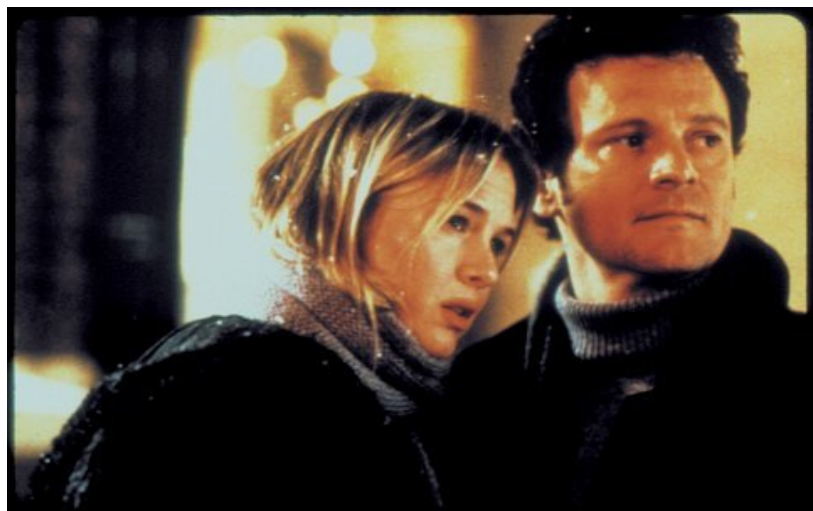
Bridget Jones's Diary