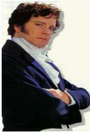
Colin Firth in Pride and Prejudice

The movie is opened with first day of the year lunch in which is invited Mark Darcy (Colin Firth) , a childhood friend. Many parallels can be found between this book and Jane Austen's Pride and Prejudice , most noticeably in the male protagonists' last names as well as character traits (compare Fitzwilliam Darcy to Mark Darcy).